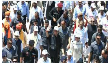
every narco-terrorist and permanently dismantling their networks," Sinha said. He said that during the last 56 days, people from all walks of life

JAMMU JUNE 6: Jammu and Kashmir Lieutenant Governor Manoj Sinha on Saturday led a massive padyatra in Kishtwar as the ongoing drug-free J&K campaign reached its 9th district, reaffirming the administration's commitment to eliminating drug abuse and narco-terrorism from the Union Territory. The Lieutenant Governor said the fight against drugs is a long-term battle that requires sustained, round-the-clock efforts and collective participation. Addressing a public rally in Kishtwar, the Lieutenant Governor said authorities were breaking the chain of the drug trade at every level and vowed stringent action against drug smugglers and narco-terrorists. "We are breaking the