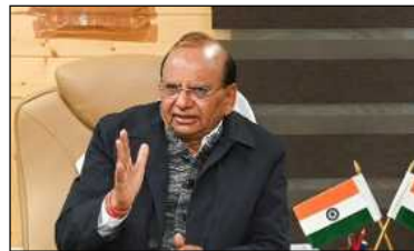
tourism. The region is often cut off from the rest of the country

LEH/JAMMU, Jun 6: Ladakh has witnessed a historic surge in tourist arrivals this year, recording a growth of more than 43 per cent during the first five months of 2026, a development that authorities attributed to improved infrastructure, better connectivity and sustained efforts to promote the Union Territory as a premier tourism destination. Known as the "cold desert", Ladakh remains one of India's most sought-after tourist destinations, famed for its dramatic landscapes, pristine lakes, ancient monasteries and adventure